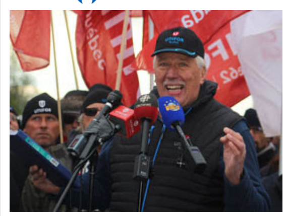
Couldn't make it to Gander but want to see updates? Watch the livestream